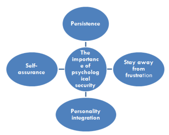
Figure (01): the importance of psychological security (Muhammad Al-Sharif, 2003, 15 p)