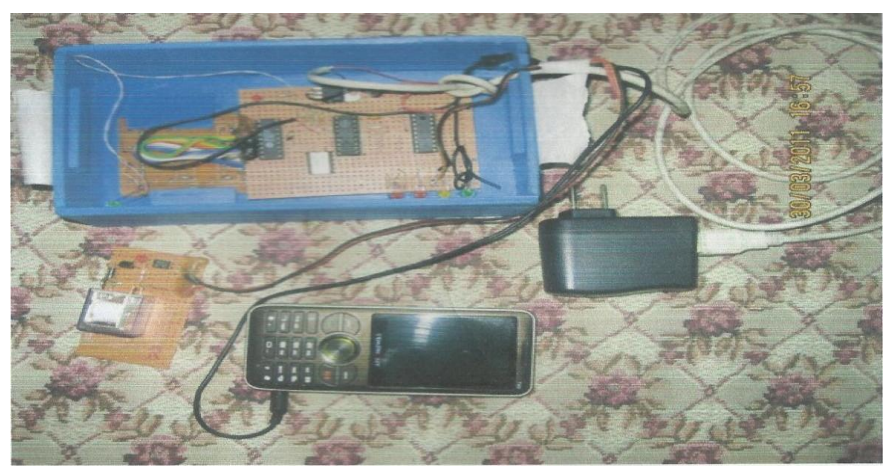
Fig 3. shows the practrical implementation of the circuit.