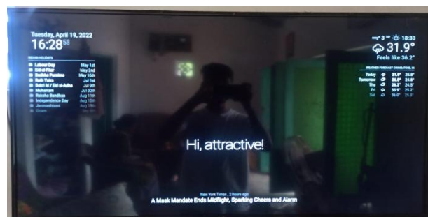
Fig. 2. Image of the smart mirror with Date and Time

Fig.2 shows the output of the date and time to the user after installing date and time packets which is written in the form of Node. Js, here the user can be able to see data and time interface through the glass firm.