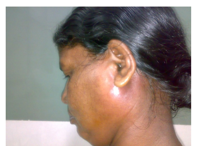
Figure 4-Case-2-Odontogenic parotid space infection due to abscess