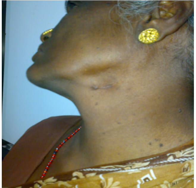
Figure 3-Case-1-post op after 3 months