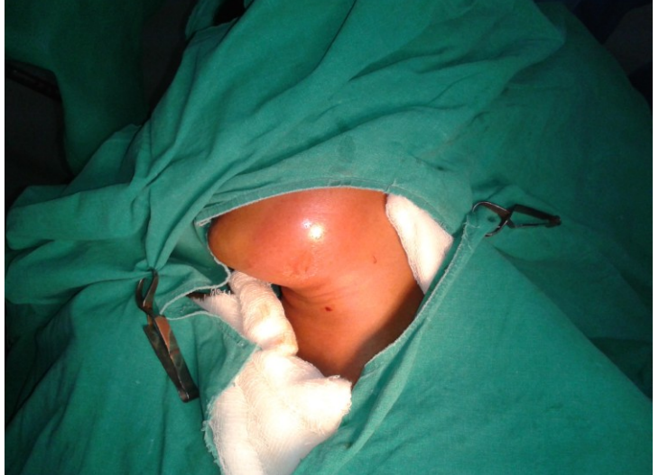
Figure 6 case 3 SUBMANDIBULAR ABSCESS