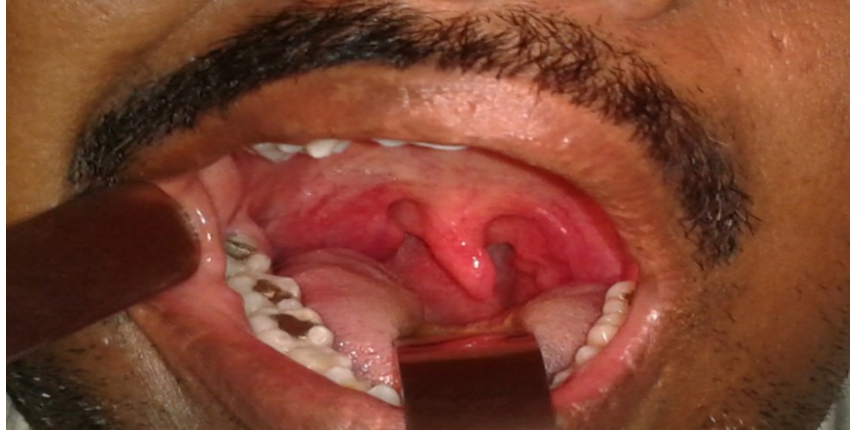
Figure 7 CASE 4 RIGHT PERITONSILLAR ABSCESS