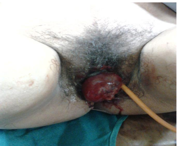
Figure1:A large reddish purple mass coming through vagina