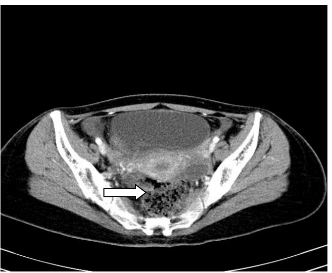
Pic 3: Evidence of complex cystic lesion (20 – 30 HU0 seen in Rt adnexal region measuring approximately 6. 8 cm in transverse diameter & 4.6 cm anteroposteriorly