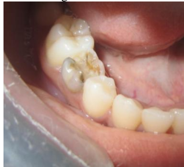
Fig 2 b

Pre operative IOPA showing overretained mandibular right 1 st molar