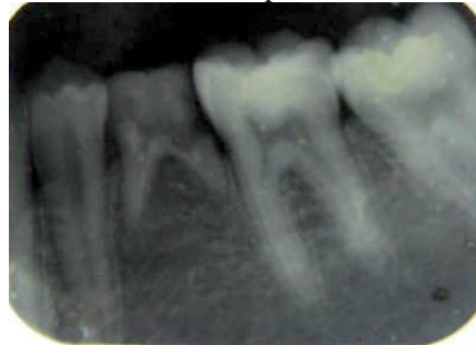
Fig 2 a

Pre operative IOPA showing overretained mandibular right 1 st molar