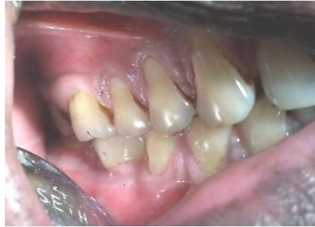
Fig 1 e

Implant supported prosthesis with mandibular right 1 st molar