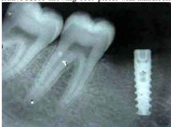
Fig 3 b

Pre operative IOPA showing root pieces with mandibular molar