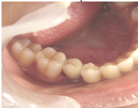
Fig 2 f