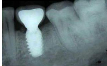
Fig 1 f

Implant supported prosthesis with mandibular right 1 st molar