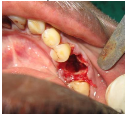
Fig 1 b Intra operative after atraumatic extraction of mandibular right 1 st molar