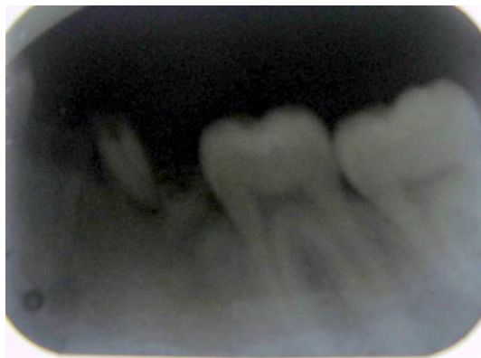
Fig 3 a

Pre operative IOPA showing root pieces with mandibular molar