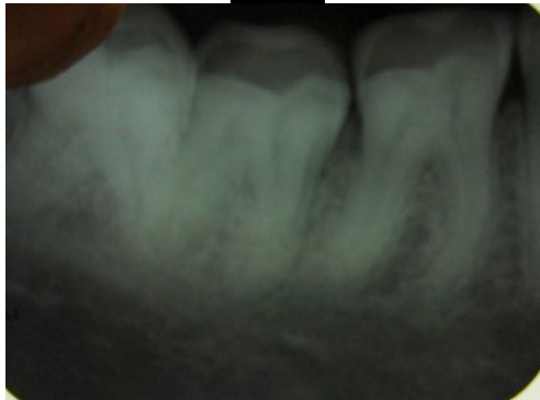
Fig 1 a Preoperative IOPA