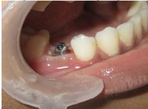
Fig 2 e

Intra operative view after implant placement