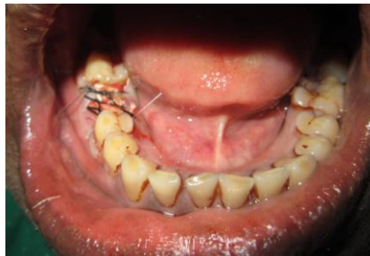
Fig 1 c Placement of GTR membrane and suturing