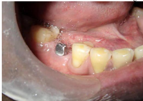
Fig 1 d Abutment at the time of prosthesis