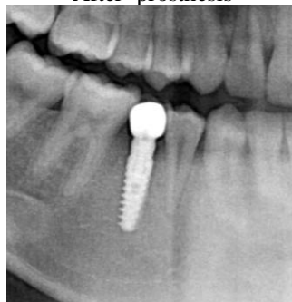
Fig 2 g