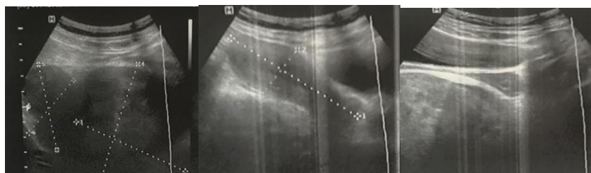
Figure 1 : Pelvic ultrasound

We present the case of a 25-year-old patient with no significant medical history, consulting for atypical pelvic pain and a sensation of heaviness persisting for over a year, all occurring in an afebrile context. Pelvic ultrasound revealed a giant retro-uterine pelvic tissue mass, heterogeneous and hypoechoic, not associated with any specific organ (Figure 1). Abdomino-pelvic CT indicated a retro-uterine presacral pelvic mass, roughly oval-shaped, well-defined, measuring 132x116 mm, with heterogeneous density, displacing the uterus and bladder anteriorly and showing sacral bone lysis, suggestive of a neurogenic tumor (Figure 2). MRI revealed a lobulated and circumscribed pelvic tissue mass measuring 110x126 mm, seemingly originating through the sacral foramina, suggestive of a schwannoma (Figure 3). The patient underwent surgery via both abdominal and Kraske's posterior approaches, allowing en bloc resection of the tumor and sacrum. Postoperative recovery was uneventful. Histological and immunohistochemical examination (positive staining with anti-PS100 antibody) concluded a schwannoma with necrotic areas and no signs of malignancy.