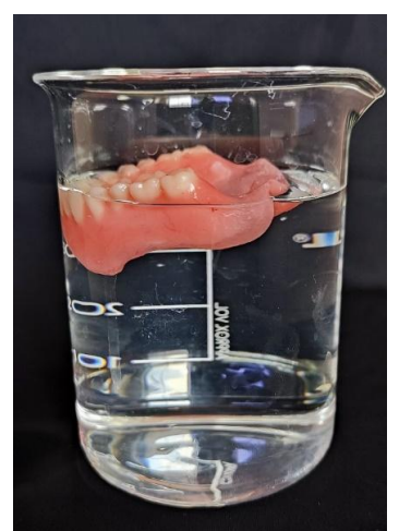
FIG 6- Water test used to ascertain the hollow space which is revealed by the floating denture