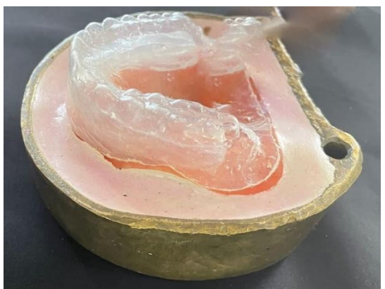
FIG 4- Verifying the accurate fit of the biostar template spacer with the assistance of the template 2 made after try in of the denture.