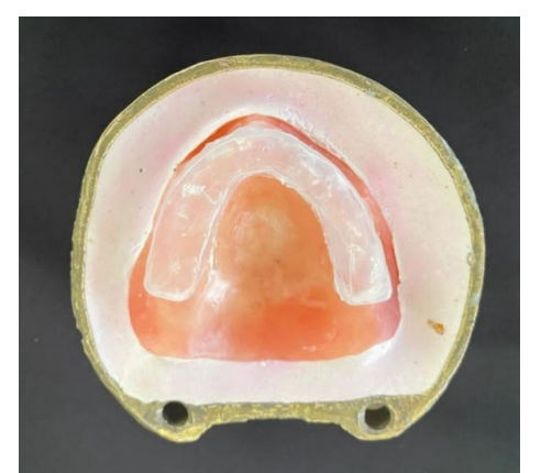
FIG 5- Biostar template spacer stabilized over the ridge of the flasked and de-waxed maxillary denture base.