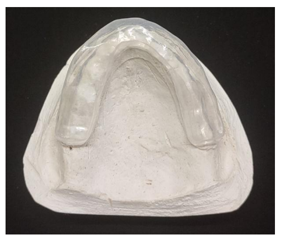
FIG 3- Sealed templates 1 and 3 to each other after removal of the putty roll from between them.

FIG 2- Roll of putty fabricated and adapted on the master cast (with a template of Bioplast transparent film adapted on it- template 1) according to the area that has to be hollowed out