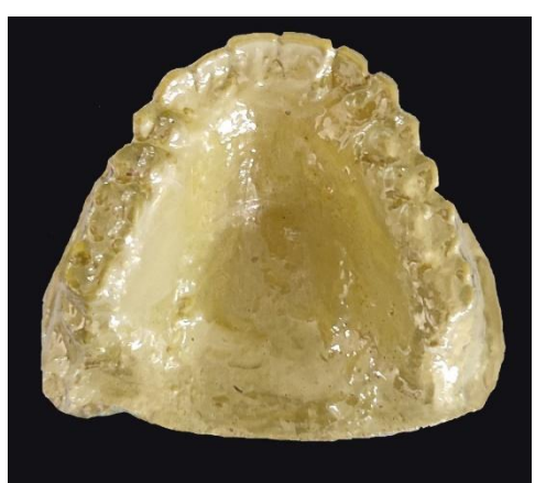
FIG 1- Fabricated template of Bioplast transparent film on working cast (Template 2)