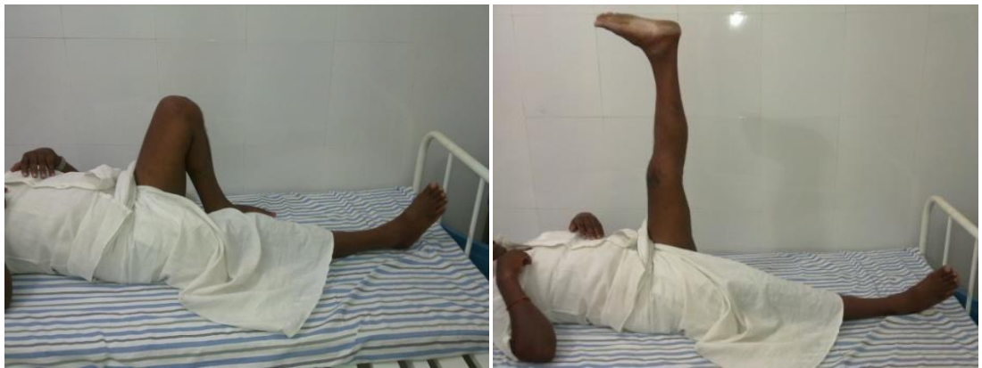
Good functional recovery of the patient whose radiographs are shown immediately above.