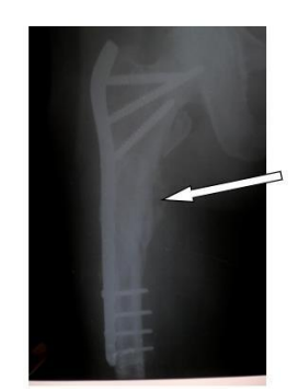
Solid union shown by arrows

He was started static quadriceps exercises the next day and knee flexion and extension exercises later. he was discharged after 3 weeks later after suture removal His 2 months follow up radiographs are shown below