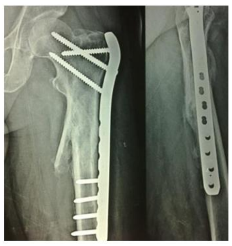
Another patient with a Non anatomic reduction