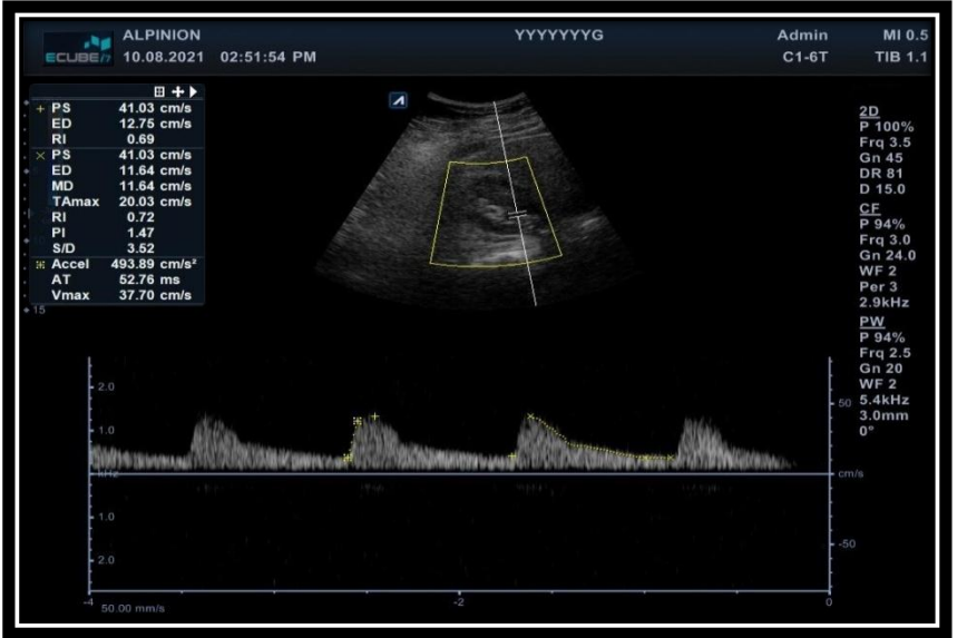
figure (1) female, 30 years age, hypertensive right renal artery Doppler index(RI = 0.69, PI = 1.4, AT = 52.7 ms, PSV = 41 cm/s, EDV = 12.7 cm/s)