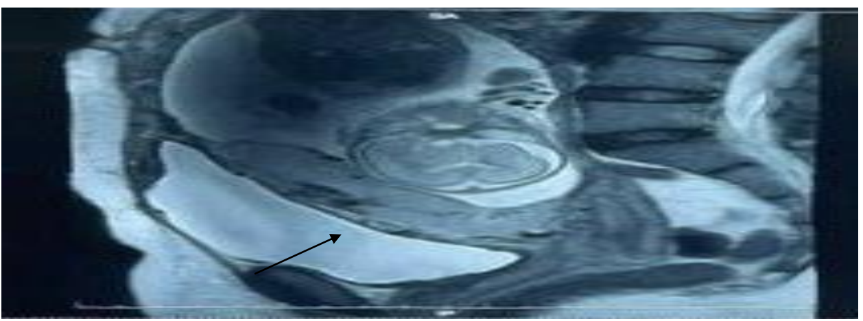
FIGURE 1- MRI FINDINGS SUGGESTIVE OF SMALL AREAS OF EXTENSION TO URINARY BLADDER.