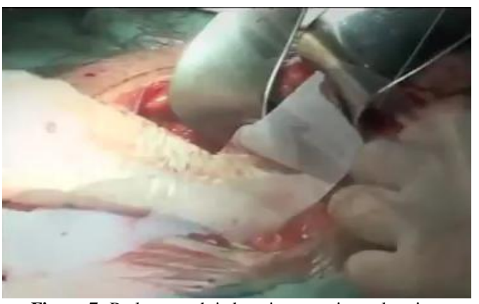
Figure 7: Prolene mesh is kept in preperitoneal region