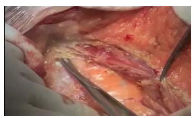
Figure 5: Vertical separation of both recti done to enter pre-peritoneal space

Direct hernias were identified and reduced. Large sacs were removed and ligated with a purse-string suture. Indirect sacs were divided, the proximal peritoneum was sutured, and the distal peritoneum was left in place attached to the cord. Separation of the spermatic cord and gonadal vessels was performed by dissection of their peritoneal attachment. Two prolene mesh of 15 by 15 \text{cm}^2 were placed in the preperitoneal space in bilateral inguinal region. Fixation of the mesh was done by suturing mesh with pubic tubercle on both sides.