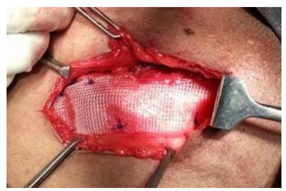
Figure 4: Placement and fixation of mesh with stay sutures

Using a single nonabsorbable monofilament suture, the lower edges of each of the two tails are fixed to the inguinal ligament just lateral to the completion knot of the lower running suture. The excess patch on the lateral side is trimmed, leaving at least 5 cm of mesh beyond the internal ring. This is tucked underneath the external oblique aponeurosis, which is then closed over the cord with an absorbable suture.