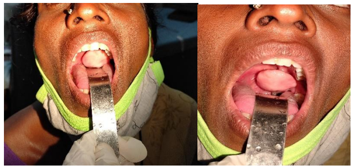
Fig 1&2: showing a mass in the oral cavity.

On examination her general condition and vitals are normal. Examination of oral cavity shows 4cm x 3cm pedunculated mass which is pale in color, firm in consistency, arising from the junction between soft palate and hard palate on the left side which is partially obstructing the oropharynx.