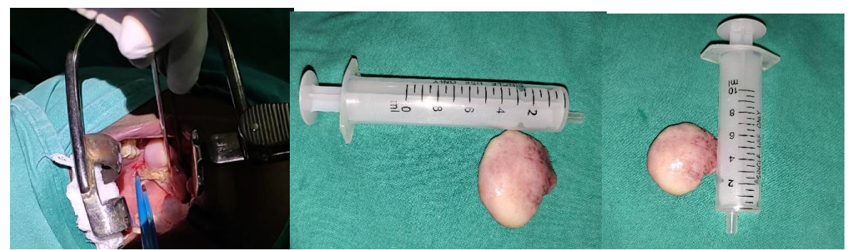
Fig 6,7&8: shows a specimen sample of the mass

We plan for excision of the mass and further histopathological examination. Under general anesthesia, mass was excised and removed then the base was cauterized. Specimen sample sent for biopsy.