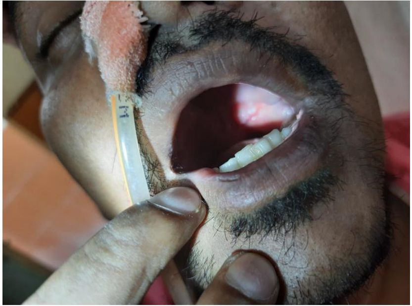
Fig.5 showing healing tissue after surgery