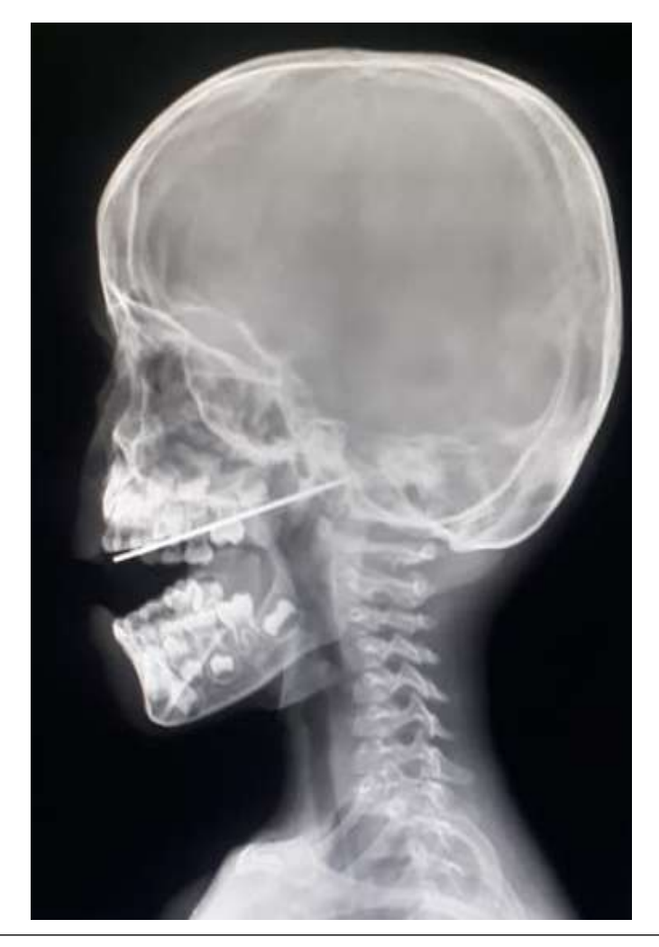
Fig.3 showing an x-ray nasopharynx with a radiopaque foreign body

An urgent x-ray nasopharynx showed a straight radiopaque object penetrating the hard palate passing through the floor of the sphenoid sinus touching the clivus.