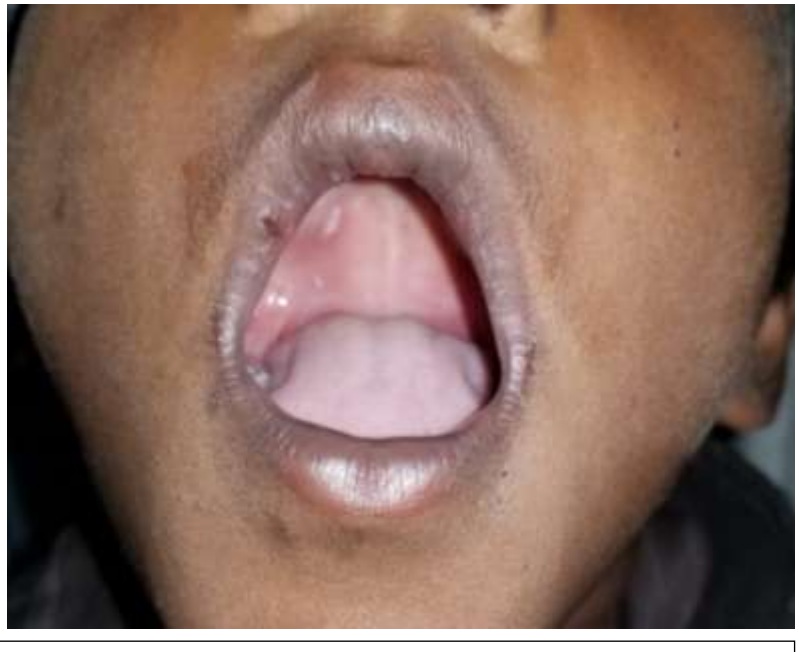
Fig.6 showing the oral cavity after foreign body removal

The nail was around 12 cm in length. The child was on nilper oral for 8hours and was on IV antibiotics and discharged on the 2^{nd} postoperative day.