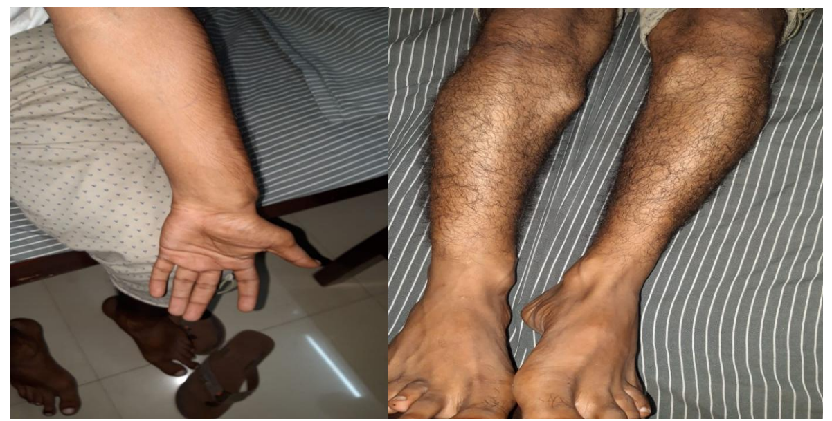
Figure 1 Figure 2