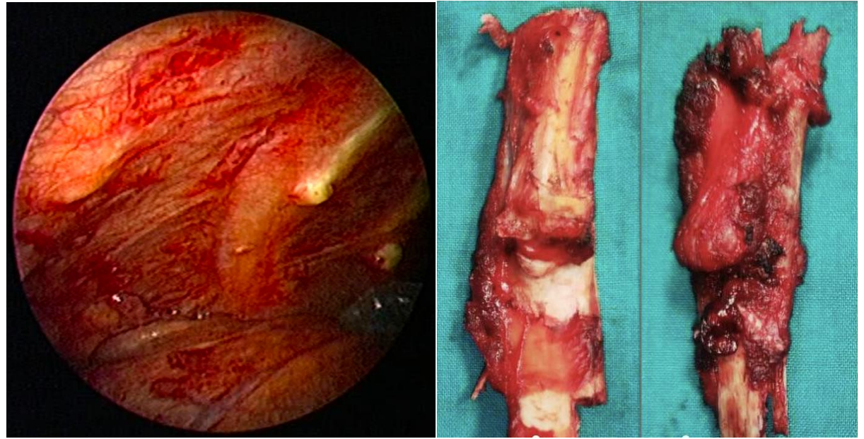
Figure 7 Figure 8