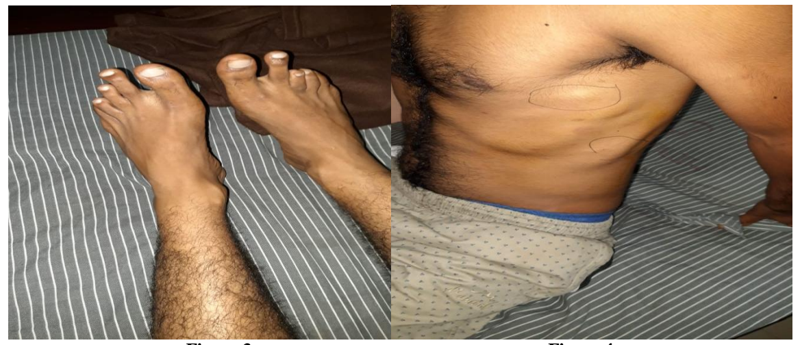
Figure 3 Figure 4