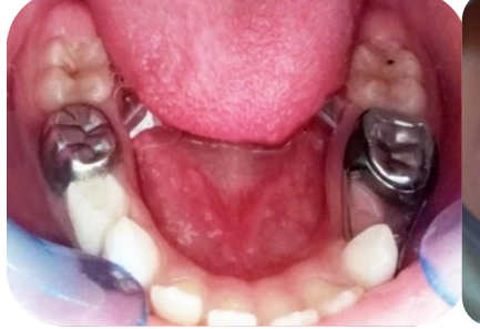
(d) Nine months postoperative; normal gingival tissues related to no changes related to bilateral Es. bilateral Es