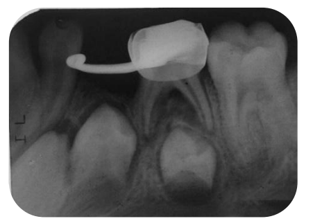
(d) Nine months postoperative; static size of furcation radiolucency