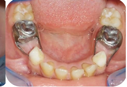
(f) 18 months postoperative no gingival changes related to bilateral Es.