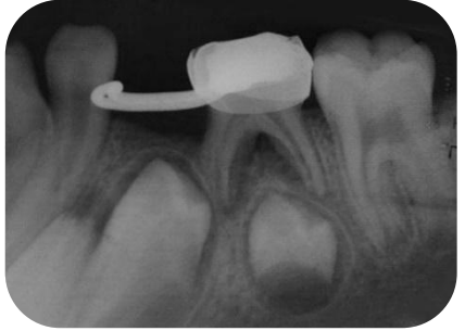
(c) Six months postoperative; ; more reduction in the size of furcation radiolucency