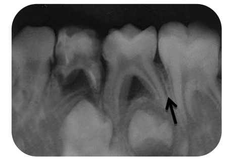
Preoperative ;furcation (a) radiolucency related to lower left E