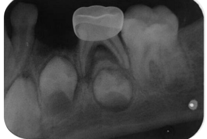
three months postoperative; (b) reduction in the size of furcation radiolucency