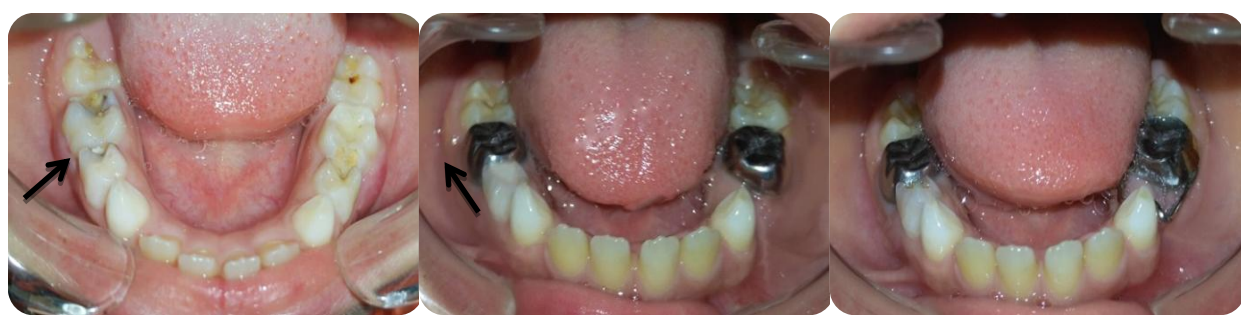
(a) Preoperative photo with bilateral abscesses related to bilateral 2<sup>nd</sup> molars.

(b) Three months postoperative; healing of abscess and absence of fistula related to bilateral Es.