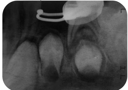
(f) 18 months postoperative; decrease in the size of furcation radiolucency