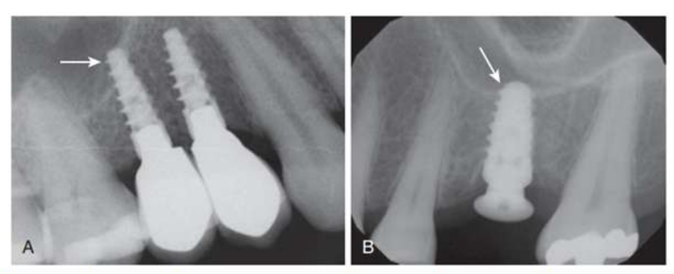
Figure 2: SA-2. (A) Radiograph depicting an SA-2 (maxillary second premolar) and SA-1 (maxillary first molar). (B) SA-2 implant that includes implant insertion with penetration into the maxillary sinus proper 1 to 2 mm without bone grafting.