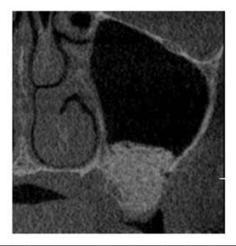
Figure 4: SA-4: Treatment plan that includes bone grafting via the lateral-wall approach with no implant placement. Implant placement is delayed according to the healing of the sinus graft sites.

Indicated when there is less than 5mm bone present between the residual crest of bone and floor of the sinus. At first sinus elevation is done with the lateral window preparation followed by bone augmentation. Then evaluate the bone after 4 to 6 months and the treatment approach is planned accordingly.