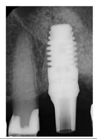
Figure 3: SA-3: Implant insertion with bone grafting via the lateral-wall approach gaining more than 4 mm of height (i.e., amount of height is determined by size of lateral wall)