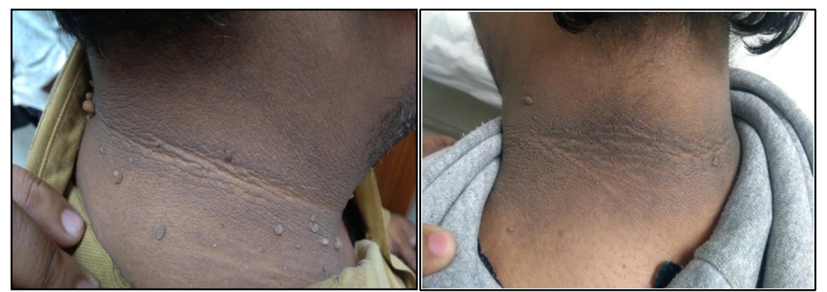
Figure 1 - Acrochordons with AcanthosisNigricans