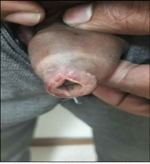
Figure 2- Candidal Balanoposthitis