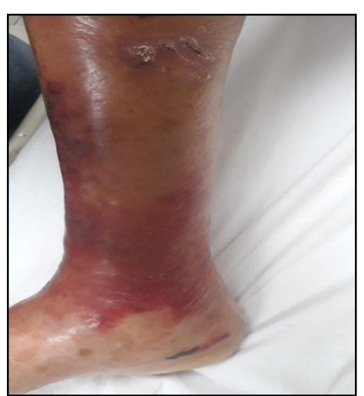
Figure 3 – Erysipelas