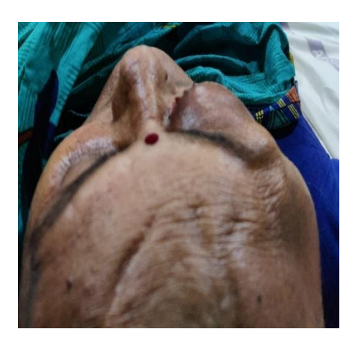
Figure 1: Figure 2: