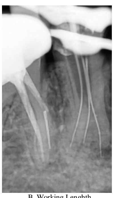
B. Working Lenghth