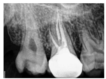
Figure 4: post operavtive radiograph after crown placement