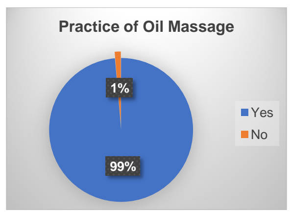
Figure 2: Practice of oil massage (N=146)

One hundred forty-four (98.6%) children were massaged with oil and only 1.4% babies were not massaged with oil.