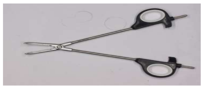
Figure no 1: BiClamp instrument

A circular incision was made around the cervix, the pouch of Douglas was opened posteriorly and the bladder was separated from the uterus anteriorly. In conventional suturing technique group, pedicles were clamped, cut and then transfixed (uterine artery pedicle was ligated) using vicryl 1-0 suture. For those patients who were operated by electrosurgical bipolar vessel sealer, vessel sealer (BiClamp) was used on all of the pedicles on both the sides (cardinal ligament, broad ligament including the uterine arteries, and the round and utero-ovarian ligaments) Figure no 2, 3. The pedicles were clamped and sealed. The clamp was released after the two-beep sound from the system (indicating adequate coagulation) and coagulated pedicle was cut. Closure of vaginal cuff was identical in both study groups.