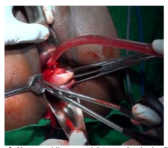
Figure no3: Uterosacral ligament (right) coagulated using BiClamp

The procedure time for all cases was calculated from initial incision on the vaginal mucosa to complete removal of uterus. Time taken for pelvic repair and other concomitant procedures was not included.