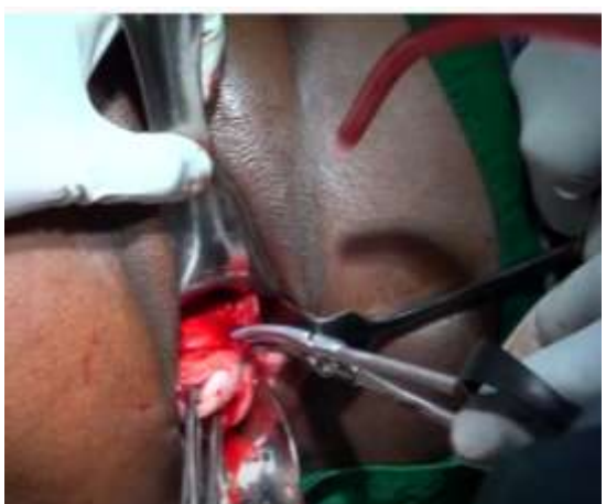
Figure no2: Uterosacral ligament (left) coagulated using BiClamp