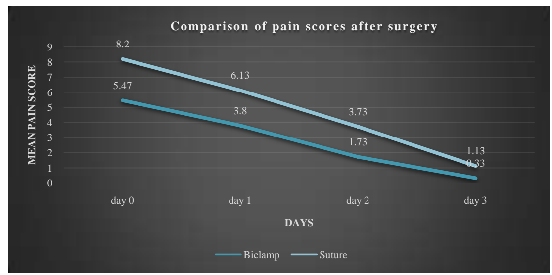
Figure no 4:Mean pain score

In the BiClamp group, three patients sustained unilateral labial burn when the hand-piece came in contact with the labia inadvertently which was immediately detected and managed conservatively. The healing occurred without scarring. One patient had injury to bladder in suture group. Pelvic hematoma was noticed in one patient in suture group. Both the groups had similar ratio in regards to UTI. Urinary retention was noticed in 1 patient in BiClamp group and 2 patients in suture group. Complication rate did not differ significantly. Table no 6 and Figure no 5 shows intra-operative and post-operative complications encountered in both study groups.