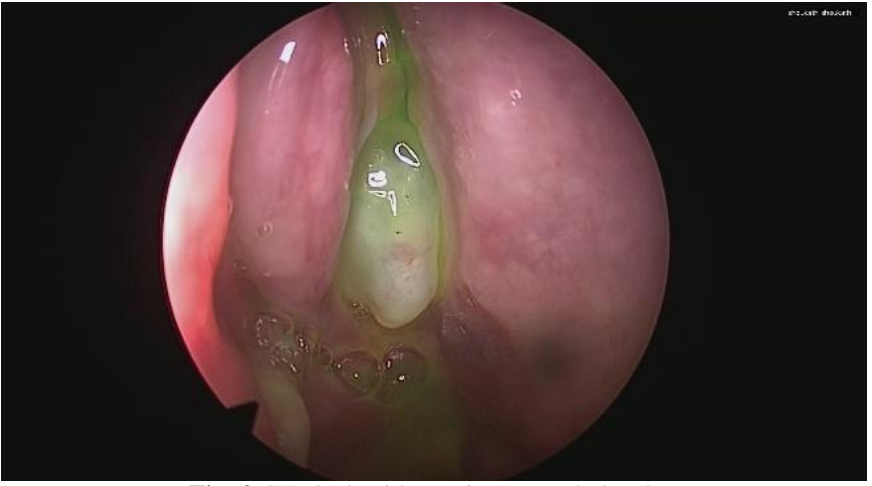
Fig. 2 CSF leak with meningoencephalocele