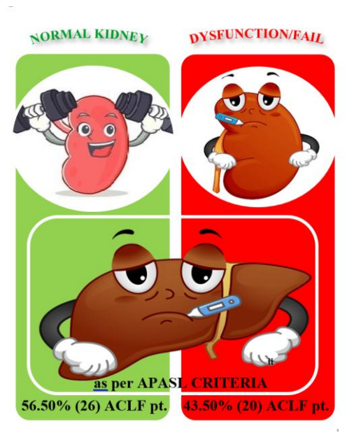
Figure 3: Incidence of normal kidney functioning and altered functioning in ACLF patients (diagnosed by APASL definition).

In our study, majority of patients of ACLF (56.50%) does not have kidney dysfunctioning or kidney failure. So, our study does not support the EASL criteria for definition of ACLF grade I for having either single organ failure as kidney or any other organ failure along with kidney dysfunctioning.