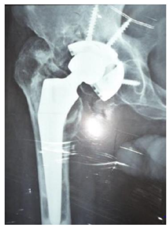
Figure 3:Bipolar loosening of a THA with screwed acetabulum and cemented stem.

Late dislocation of the prosthesis (40%) and aseptic loosening (30%) (Figure 3) are the main causes of femoral revision, followed by septic loosening (15%) (Table 1). 14 were bipolar revisions (70%) and 6 were isolated revisions of the femoral implant (30%).