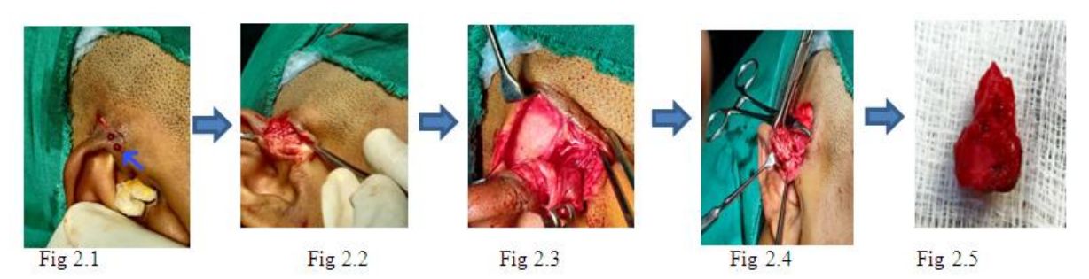
Fig 2: Pre auricular sinus excision by supra auricular approach- surgical steps

Supra-auricular approach : The elliptical incision used around the sinus opening was extended down to the upper end of the tragus and up parallel to the anterior edge of the anterior helix (Fig 2.1). The incision was deepened(Fig 2.2) till the temporalis fascia was identified as a medial limit of the dissection(Fig 2.3). The dissection continued over the cartilage of the anterior helix. The base of the sinus attached to the perichondrium of the anterior helix was excised (Fig 2.4) with the perichondrium to ensure complete excision of the epithelial lining along with surrounding soft tissues. (Fig 2.5)<sup>3</sup>