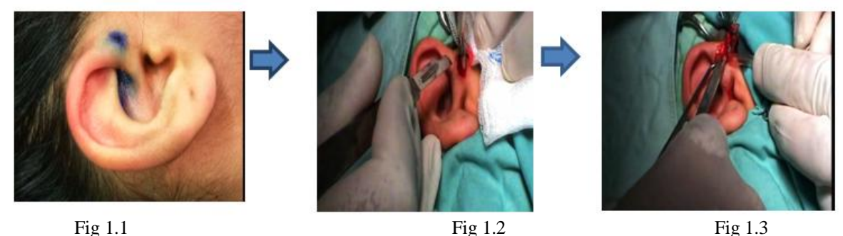
Fig 1.2 Fig 1.3 Fig 1.3 Fig 1: Pre auricular sinus excision by simple sinusectomy-surgical steps

Supra-auricular approach : The elliptical incision used around the sinus opening was extended down to the upper end of the tragus and up parallel to the anterior edge of the anterior helix (Fig 2.1). The incision was deepened(Fig 2.2) till the temporalis fascia was identified as a medial limit of the dissection(Fig 2.3). The dissection continued over the cartilage of the anterior helix. The base of the sinus attached to the perichondrium of the anterior helix was excised (Fig 2.4) with the perichondrium to ensure complete excision of the epithelial lining along with surrounding soft tissues. (Fig 2.5)<sup>3</sup>