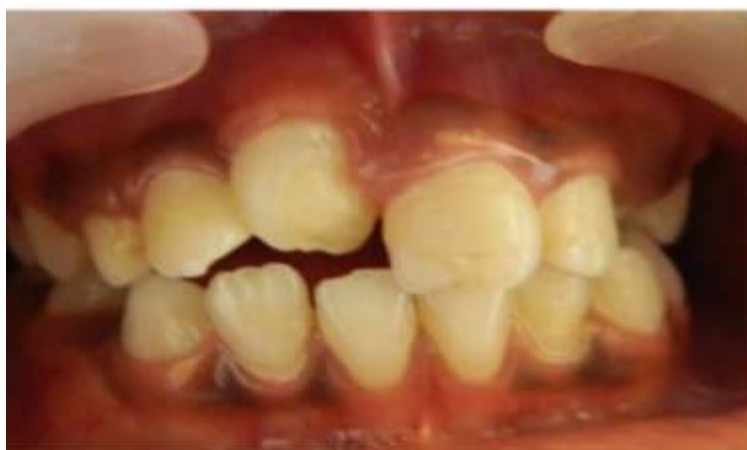
Fig:6: post-operative photograph after 6 months of case II.