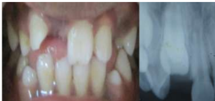
Fig: 4: Pre-operative photograph and radiograph of case II.