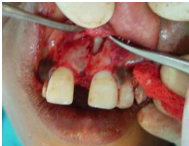
Fig: 2: Exposure of impacted mesiodens of case I.