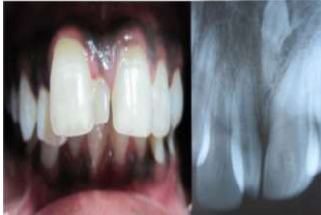
Fig: 1: Pre-operative intraoral photograph and radiograph of case I.