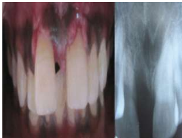
Fig: 3: Post-operative photograph and radiograph of case I.