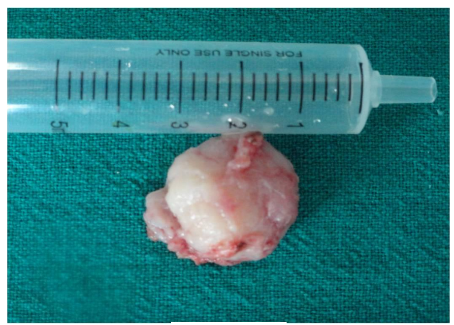
Fig.3- Excised tumor.