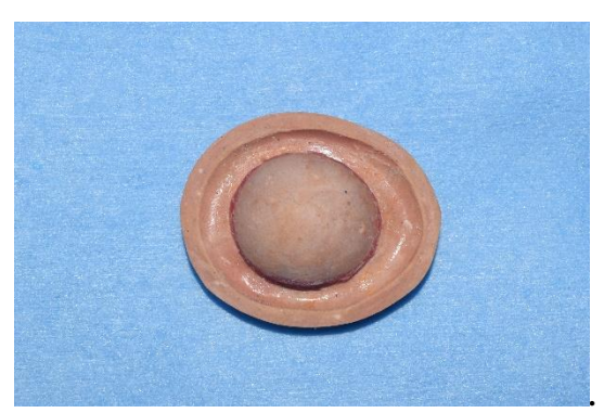
Fig 5: Die stone mould