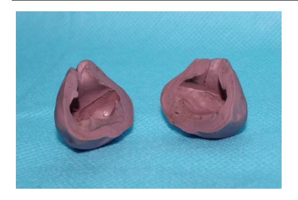
Fig 9: Opened putty index