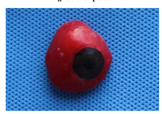
Fig 12: Completed wax pattern of ocular prosthesis with iris