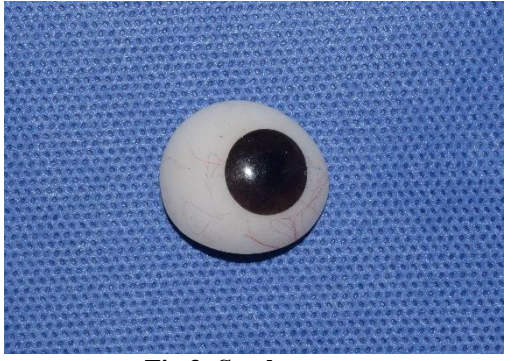
Fig 3: Stock eye