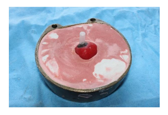
Fig 13: Needle hub positioned