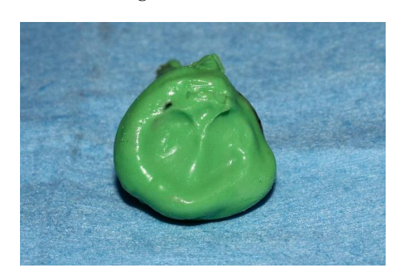
Fig 7: Impression of eye socket