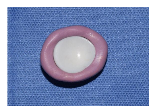
Fig 4: Putty Index