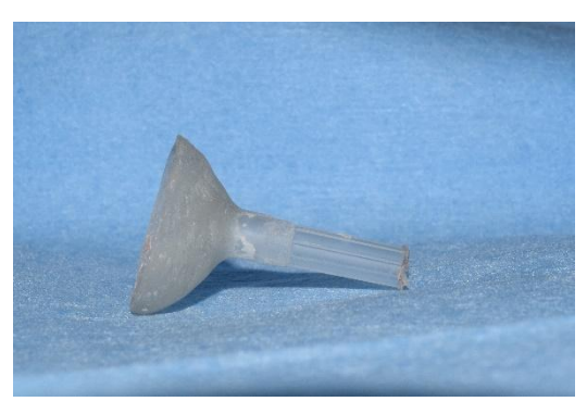
Fig 6: Acrylic stock tray