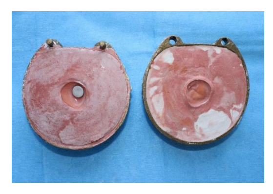
Fig 14: After dewaxing