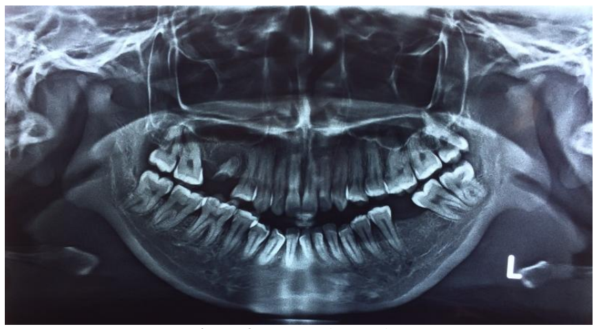
Figure 2. Panoramic Imaging

On panoramic examination (Fig 2) found that both side condyle head had toadstool appearance characteristic which marked by flattening and apparent elongation of the articulating condylar surface and dorsal (posterior) inclination of the condyle and neck. Condylar neck in the right side was shorter compared to the left side. Articular eminence in both side was flattening. Antegonial notch was deepened in both side. Based on RDC/TMD diagnostic criteria alogaritm Axis I and also confimed with radiograph, we diagnosed the patient as bilateral osteoarthritis and myofasial pain with limited opening.