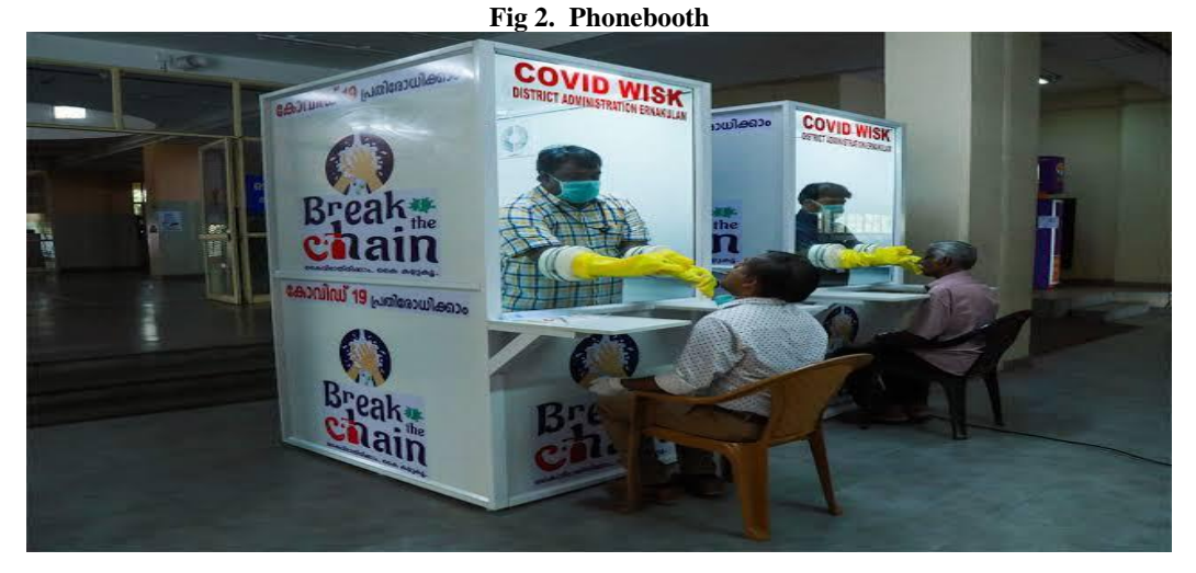
. . .

Jharkhand has begun using the Phonebooth testing method to tackle this novel Coronavirus . This testing method involves collection of sample from inside a box of aluminium and glass .