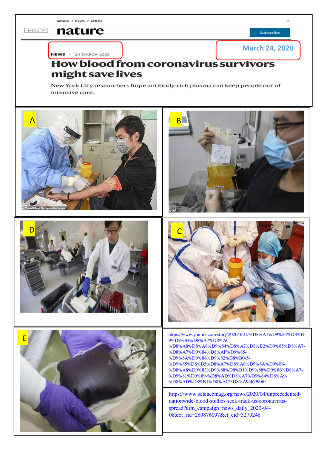
Figure 3. Successful application to blood/plasma transfusion among COVID-19 patients in China, (photos marked A,B and C) and USA (photo marked D,E). Photos A,B, C and D were obtained from www.youm7.com+ details shown in the box; Photo E was obtained from Science. Details in the box.

So far, providing plasma as a treatment to the patients can be a specific treatment due to its anti-viral contents, but providing blood as a treatment, may be better than providing only plasma because blood contains plasma and can improve the oxygen carrying capacity of the blood inCOVID-19 patient, who is in a bad need for a ventilator during the treatment process.