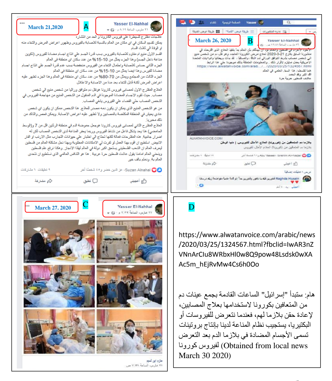
Figure 2. Antibody transfusion throughout blood in different countries. Where A,B,C, D and E are the 1<sup>st</sup> announcement of using blood as a potential treatment of COVID-19 patients, on home page at Facebook on March 21, blood transfusion in different country as announce by alwatanvoice on March 25, application of idea on Iran on March 27 and talking about the application of the idea on Israel on March 30-2020

coronavirus 2 (SARS-CoV-2) infection. In this report, the dose of plasma was 400 ml plasma/ patient. All the patients were recovered form COVID-19. 12