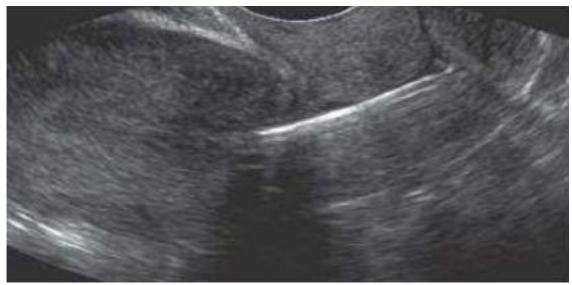
Figure 5 TVS showing IUCD lower in the cervical canal