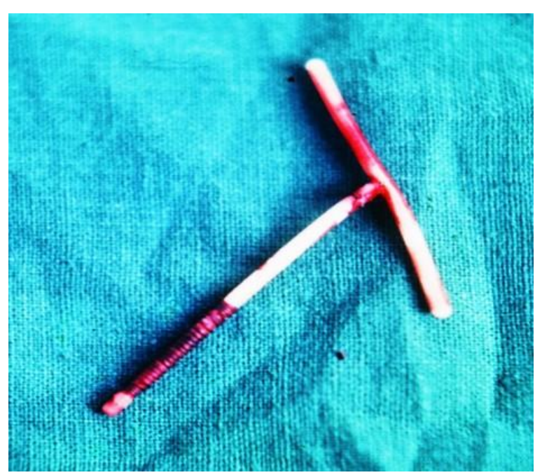
Figure 2CuT after removal by laparatomy