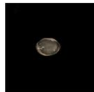
Heat cured PMMA clear acrylic resin conformer