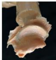
Fig 2 (e)