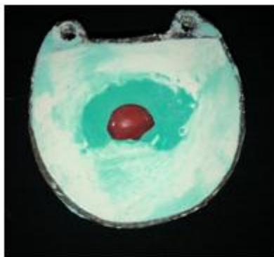
Figure No.6(a): Wax pattern is invested with stone in a two-piece flask

The entire wax pattern was invested with improved stone in a two-piece flask given in figure no: 6. When the improved stone got set, flask was opened and packed with scleral colored methyl methacrylate resin and cured in water at 212° F for 1 hour. Later the prosthesis was removed from the flask and its true scleral color was compared to the natural eye. The sclera of the prosthesis was tinted to compare favorably with the sclera of the natural eye. Veining was added by acrylic color painting to the prosthesis. The heat of a light bulb was applied to dry the added colors 6 .