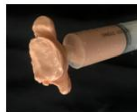
Fig 2 (f)

Figure No.2 (a): Mold made by clear PMMA acrylic resin