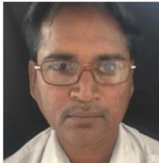
Figure No.10 (d): Final ocular