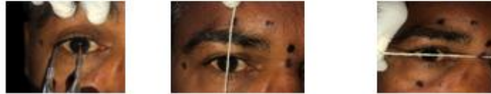
Figure No.7 (b): Measurements for centering of the pupil