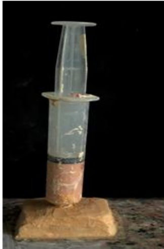
Figure No.3 (a): Impression poured in dental stone