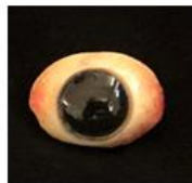
Figure No.10 (a): The polished polymerized ocular prosthesis

A tinfoil was adapted to the flask and with the help of clear methyl methacrylate resin it will be packed. Clear methyl methacrylate resin is placed in the top half of the flask, covered with a piece of wet cellophane, and trial packed. The use of the cellophane during trial packing will prevent the migration of the added colors by the expelled excess acrylic resin. When the excess clear acrylic resin has been eliminated, the final closure is made without any cellophane. Then the flask will be placed in water at 212° F and polymerize for 1 hour. After curing flask will be removed from water and let it cool down. The polymerized ocular prosthesis is finished and carefully polished (figure no: 10 a). After this the final prosthesis is placed in the socket and the orbicular muscle must be allowed to relax for at least 10 minutes to permit critical evaluation (figure no: 10 b to d). Once everything will be checked and satisfactory the prosthesis will be delivered to the patient and instructions will be given 6 .