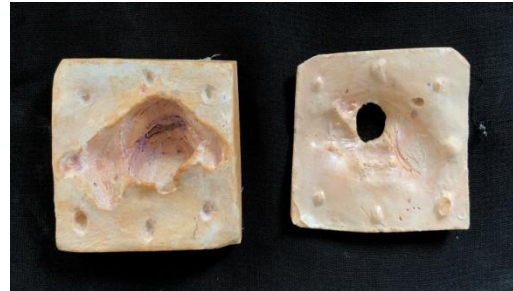
Figure No.3 (b): Two piece mold of dental stone