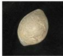
Fig 2 (a)

In 1940 U.S Armed Forces developed an indirect impression technique for fabrication of ocular prosthesis in which an irreversible hydrocolloid impression is placed within and over the socket shown in Figure No: 2(A to F). However, the injection pressure and the weight of the impression material can distort the contours of the socket itself. Allen and Webster modified the indirect technique by using an impression tray in the shape of the ocular prosthesis shown in Figure No: 3(A & B). When placed within the socket, the impression tray supports the eyelid and provides the required contour. An easily flowable, watery mix of the impression material was made and through the hollow stem of the impression tray, it was injected into the socket shown in Figure No: 2(D). The overfilling of the socket would be reversed as the tissues force the extra material out via the perforations in the tray and the hollow stem. A two-piece mold of dental stone was poured around the impression. The portion near the stem should be thin for convenience of removing the impression tray once the stone sets. A wax conformer was fabricated using this mold 6 .