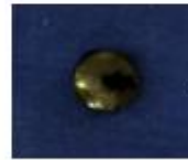
Figure No.9 (b): Iris-cornea piece