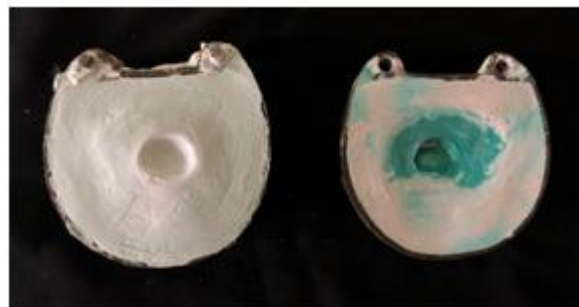
Figure No.6(c): After de waxing procedure