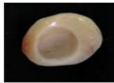
Figure No.9 (a): Space is made in the sclera for the placement of the iris-cornea piece