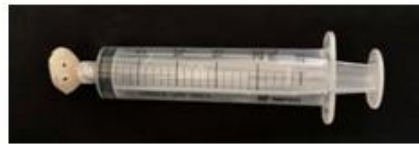
Fig 2 (b)