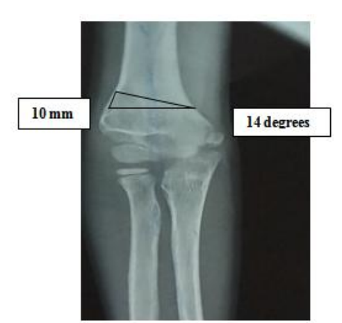
Figure 1: wedge calculation of lateral cortex

Therefore, the desired correction (X+Y) = 14 degrees. It is shown in figure no.1 along with base of wedge calculation.