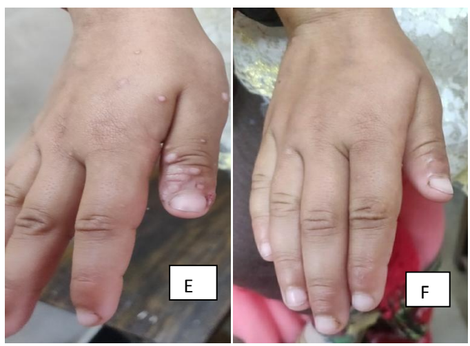
Figure3. shows multiple common wart on thumb and dorsum of hand in a 8years old child, E) before F) after 4sessions of MMR vaccine intra lesional.