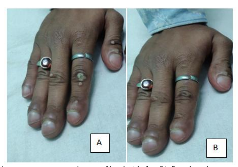
Figure 1. Multiple common warts over dorsum of hand A) before B) Complete clearance of treatment after 4weeks of treatment. The largest lesion on right index finger treated with intralesional MMR vaccine

No recurrence was seen during period of follow up till 6weeks.