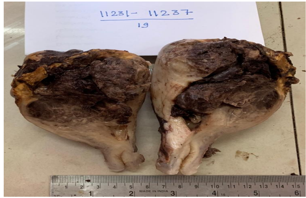
Figure 1: Gross appearance of choriocarcinoma, showing mass in the endometrium with marked area of hemorrhages.

trophoblast cells consisting of cytotrophoblast rimmed with syncytiotrophoblast with absence of chorionic villi. There is marked area of hemorrhages and necrosis. We diagnosed this case as a Gestational Choriocarcinoma.