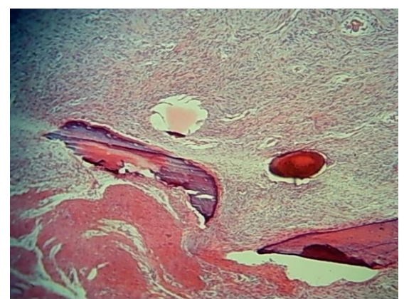
Figure 3: Area showing bone and cemental like mass {100X Magnification}

Histopathological evaluation showed fibro-cellular connective tissue interspersed with plump fibroblasts in between the collagen bundles, surfaced by parakeratinzed stratified squamous epithelium [Figure 2]. Stroma showed trabeculae of bone and scattered basophilic, cementum like substances. The histopathological features were diagnostic of peripheral ossifying fibroma. Few blood vessels with RBC and proliferating endothelial cells were also evident. Chronic inflammatory cell infiltrate was seen evenly distributed in the whole area and the cells comprised mainly lymphocytes and plasma cells. Both Clinical evaluation and histopathologic report confirmed and established the diagnosis as Peripheral Ossifying Fibroma.