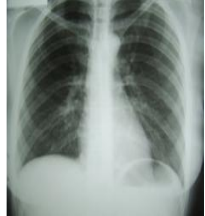
Fig 9: postoperative chest radiography