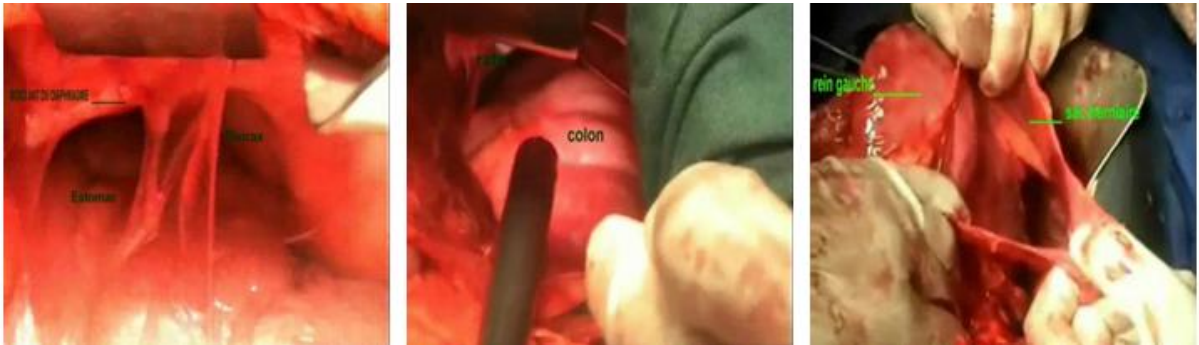
Fig 5: thoraco-abdominal communication

The patient was operated after having checked all the biological, electrical and ventilatory constancies, by pure abdominal approach. per operative exploration, had found a posterior hernia of the left diaphragmatic couple in connection with a partial agenesis of this dome (BOCHDALEK's foramen) (Fig5) with presence in the hernial sac of a part of the stomach, of the small intestine, from the left colic angle, from the left kidney in the left para cardial position and a fixed and adherent spleen at the top of the sac (Fig6-7), site of a residual hilar abscess and a inferior polar capsular hematoma. These digestive structures were fixed by numerous adhesions, which had made their reintroduction into the peritoneal cavity quite difficult. A non-prosthetic diaphragmatic repair was carried out (due to the presence of the splenic abscess) by over-going overflows with non-absorbable braided threads decimal "0" without great difficulty and the intervention ends with a double aspirative thoracic drainage and abdominal capillary after repositioning of the intra peritoneal organs. The patient presented simple post-operative follow-ups, with resumption of feeding on second day and removal of the drains on 3th day and 4th day. We did not observe any abdominal compartment syndrome and the ventilatory indices remained stable, improved by early respiratory physiotherapy. Clinical and radiological control up to 60 months remains satisfactory and no recurrence has been observed (fig 8-9).