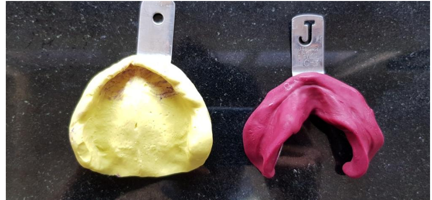
Figure 2 – Primary Impressions