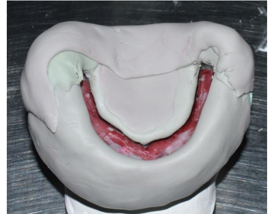
Figure 9 – Putty index fabricated for the neutral zone

The neutral zone, particular of the patient, thus recorded was preserved in its dimensions, by means of a putty index. The index was fabricated in two sections - a tongue split and a labial split, so as to facilitate its easy insertion and removal from the master model. (Fig. 9)