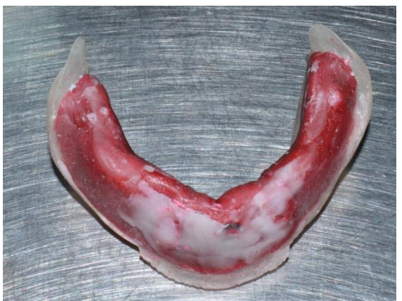
Figure 8 – Neutral zone recorded

For the recording of the neutral zone, the patient was made to sit in an upright position with the head supported in the occipital region. The impression compound was heat tempered at 65°c and the patient was asked to perform a series of actions like swallowing, speaking, sucking, pursing lips, pronouncing vowels sipping water, and slightly protruding the tongue several times which simulated physiological functioning. During function of the lips, cheeks, and the tongue, the forces exerted on the soft temperable compound, mould it according to the recording of the patient's neutral zone. The record base with the compound rim is removed and placed in cool water bath. It was then trimmed along the contours of the soft tissue and another final impression was recorded in soft liner, to ensure perfect recording of the soft tissue movements and contours, for the appropriate fabrication of the polished surfaces of the lower denture. (Fig. 8)