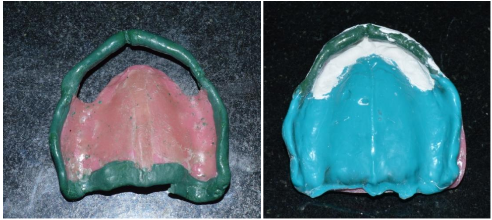
Figure 4 – Upper Arch Final Impressions

The custom tray for the lower arch was fabricated conventionally and the wash impression was made by the tertiary method. This method incorporated making the impression by rolling the green stick compound onto the tray like red cake impression compound, troughing the impression material with firm pressure from the pad of the index finger and recording the ridge details thus. After the lower ridge impression was made, the impression surface was scraped to create space for the wash impression material. The wash impression was then made with A-silicone Monophase material (Medium bodied, A-silicone, polyvinylsiloxane material;Dentsply Aquasil Ultra Monophase) (Fig.5).