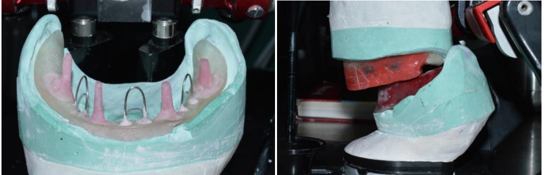
Figure 7 - Replacement of lower wax occlusal rim with an impression compound rim

After the models were mounted onto the articulator, the lower wax occlusal rim was removed. The vertical dimension of occlusion was maintained by vertical acrylic stops in the canine and the first molar region. Three loops of 19 guage wire were embedded into the record base. The occlusal rim was then fabricated in impression compound, supported by the 19 guage wire loops, so as to ensure better mouldability of the lower rim according to the patient's functional neutral zone recordings. (Fig. 7)