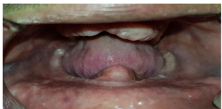
Figure 1 : Preoperative View

A 69 year old male patient, reported to the Department of Prosthodontics, D.Y. Patil University, School of Dentistry, Navi Mumbai, with a chief complaint of inability to eat food efficiently due to missing teeth. On examination, it was found that the lower residual ridge was severely resorbed and the upper residual ridge was moderately resorbed and flabby in the premaxillary segment with a prominent incisive papilla and rugae. The mucosa over the lower ridge was well keratinised and displaceable only in the floor of the mouth, which was placed higher than the lower ridge due to the severe resorption. (Fig. 1).