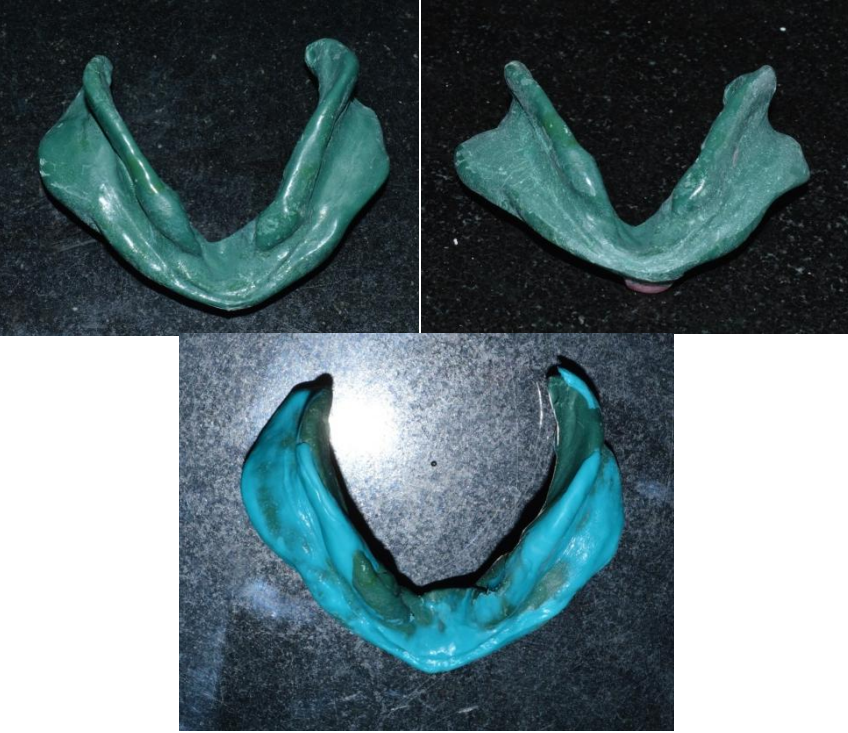
Figure 5 – Lower arch final impression

The custom tray for the lower arch was fabricated conventionally and the wash impression was made by the tertiary method. This method incorporated making the impression by rolling the green stick compound onto the tray like red cake impression compound, troughing the impression material with firm pressure from the pad of the index finger and recording the ridge details thus. After the lower ridge impression was made, the impression surface was scraped to create space for the wash impression material. The wash impression was then made with A-silicone Monophase material (Medium bodied, A-silicone, polyvinylsiloxane material;Dentsply Aquasil Ultra Monophase) (Fig.5).