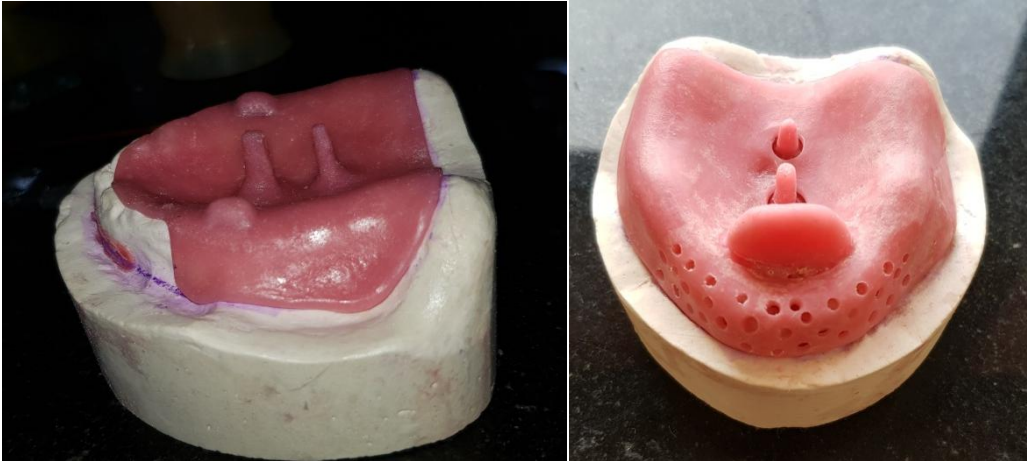
Figure 3 – Upper Arch Custom Trays