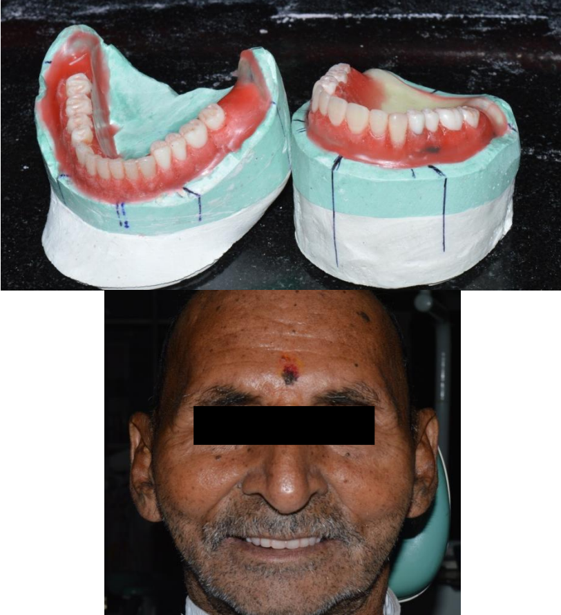
Figure 10 – Try-in of the dentures

The compound occlusal rim was then removed from the base plate, along with the acrylic stops and the wire loops and the index was adapted onto the mandibular cast. Modelling wax was melted and poured into the void left behind by the neutral zone record into the putty index. Teeth arrangement was done exactly following the index that is, within the bounds of the neutral zone, dictated by the confines of the putty index. The lower posteriors were arranged with zero degree or non-anatomic teeth. Once the waxed up trial dentures were ready, they were checked in the patients mouth for aesthetics, phonetics and occlusion. (Fig. 10)