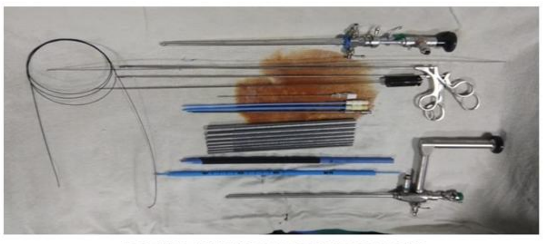
FIG INSTRUMENT TROLLEY FOR PCNL