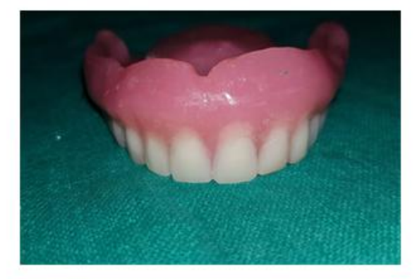
Fig.4: Maxillary complete denture with undetachable cheek plumper

The patient was recalled for regular checkups for evaluating any soreness or looseness of denture.