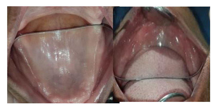
Fig.1: Completely edentulous maxillary and mandibular arches

A 57-year-old female patient with completely edentulous maxillary and mandibular arches, reported toSt. Gregorios Dental College, Kothamangalam, Kerala. On intraoral examination, completely edentulous maxillary and mandibular arches which were ovoid in shape and exhibited order 5 and order 6 respectively were noticed (Fig.1). On extraoral examination, loss of muscle tonicity and skin tone and sunken cheeks were noticed. She had lost her teeth over a period of 5 years because of periodontal diseases and was edentulous for the past 4 years. She had psychological stress due to her increased age appearance and was leading an isolated life. A treatment plan was formulated and it was decided to rehabilitate the completely edentulous arches with maxillary and mandibular complete denture along with a cheek plumper attached to maxillary complete denture.