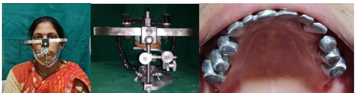
Fig 8 Facebow record Fig 9 Facebow transfer Fig 10 Coping trial in patient mouth.