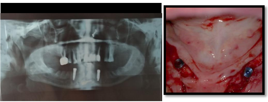
Fig 2 Post-op Orthopantomogram view Fig 3 Implant placement