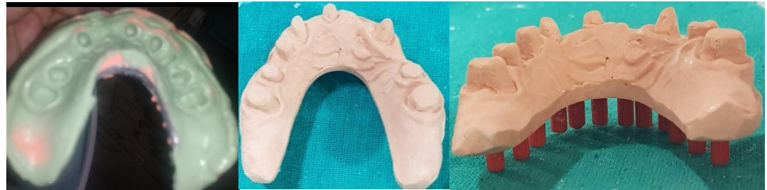
Fig 6.Final impression fig 7. Master cast after teeth preparation