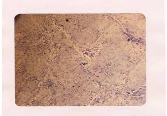
Figure-6: Microphotograph showing scant mast cells in type 'A' schwannoma (Toluidine blue x 100)

Type 'A' Schwannomas : (14 cases) (Figure-6)