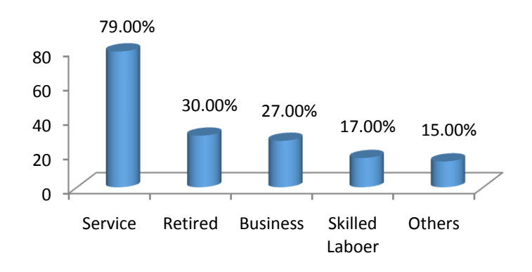
Figure I: Distribution of occupation among participants (n=168)