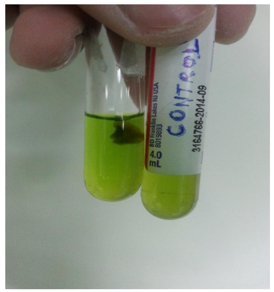
Fig 4: Positive tube Urease test with gallbladder mucosa on right test tube

In the control tube we had added urea solution and one drop of urease enzyme present in the kit and chromogen solution to yield the green coloured complex. In the test side we had added the urea solution and the sample tissue (either gallbladder/antral/duodenal mucosa) and then added the chromogen solution. And the test was considered to be positive if it turned into a green coloured solution ,the colour of which was compared to the control test tube as shown in Fig:4. The positive test indicated the presence of urease and hence H.pylori in the test sample.