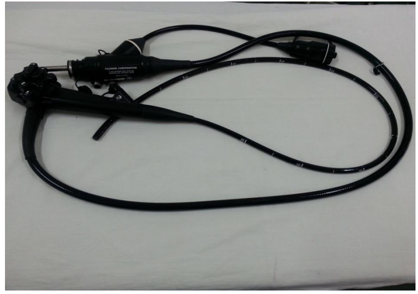
Fig 1: Flexible videoendoscope used for the study

The patients were advised to fast for 12 hours prior to the procedure and informed consent was taken from the patient. Oral 4% lignocaine spray was given to the patient 5-10 minutes before the procedure for the local anaesthetic effect. Only a few patients were given 2 mg midazolam intravenously for sedation depending on the preference of the consultants. The upper gastro-intestinal endoscopy was performed with flexible videoendoscope(Fujinon SN9G246A152) with patients in left lateral position.