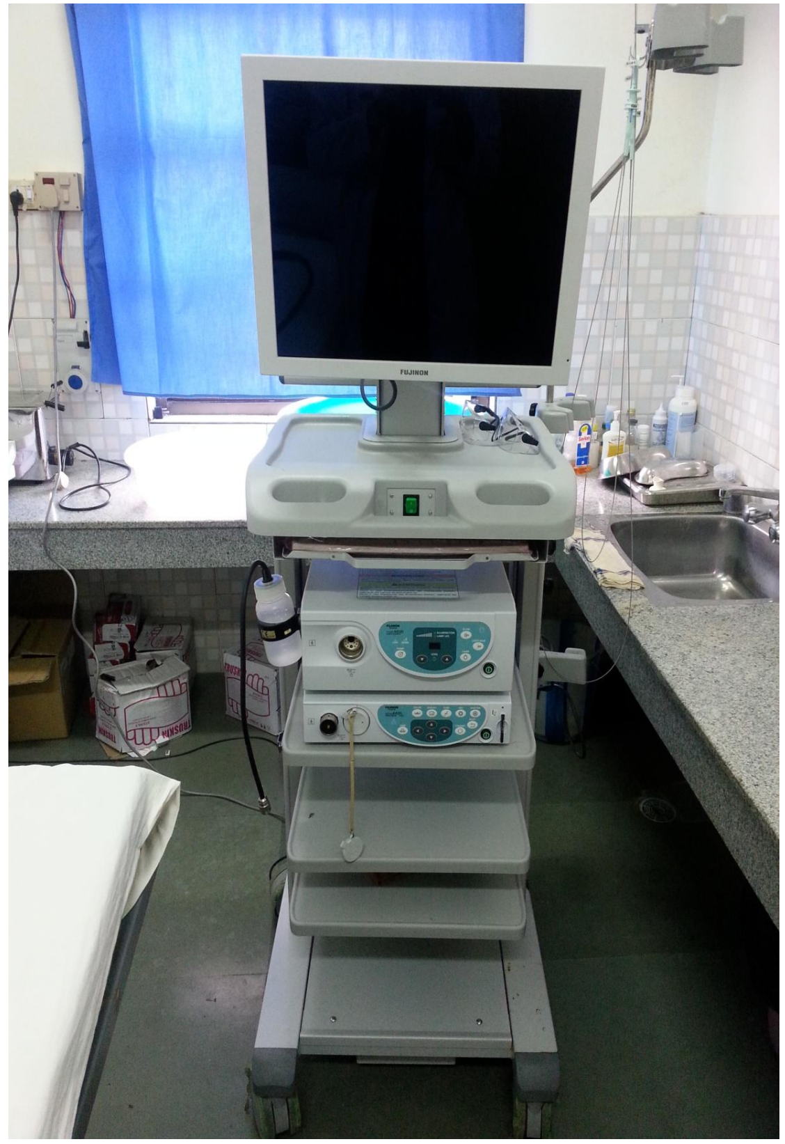
Fig 2: Fujinon endoscopy machine used for the study