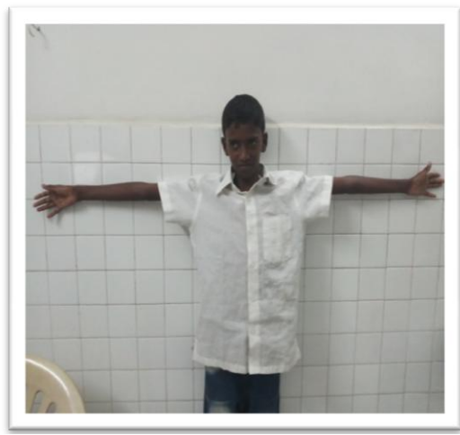
Figure 1: Full view of the patient

-2.00 \times 10^{\circ} cyl with improvement to 6/18 in both eyes. The Recommended glasses prescribed to patient . Patient was advised for a regular ocular examination every three to six months. In view of findings in cardiovascular examination patient was advised to cardiologist in view of further management.