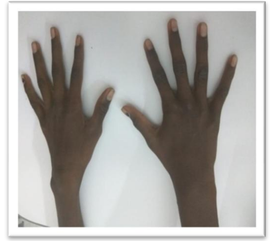
Figure 2: Arachnodactyly (Long Fingers).